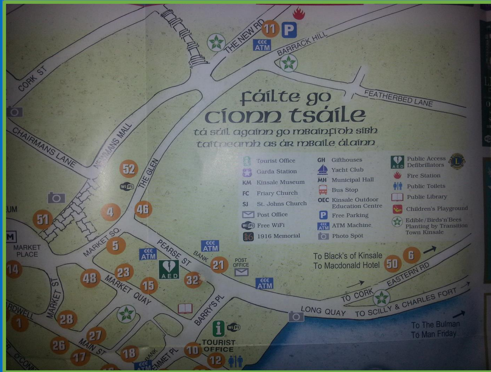
Edible Landscaping trail