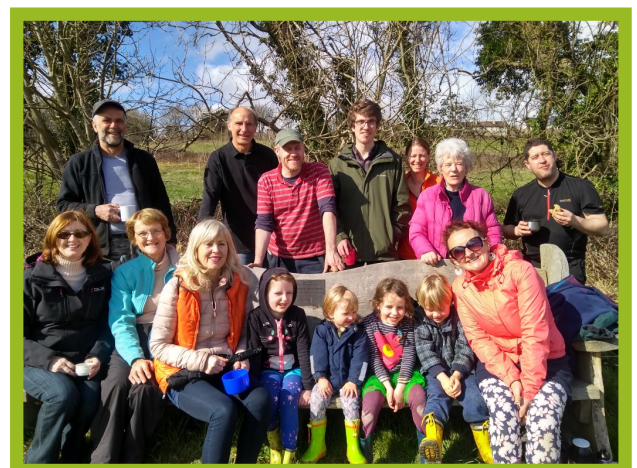
Meitheal At Community Orchard at Sáile