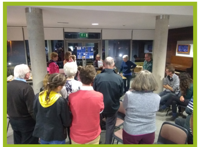
Zero Waste Workshop

TTK also made a submission to the Issues Paper for the Regional Economic and Spatial Strategy (RSES) for the Southern Region and we were invited to attend the workshop to look at How can the RSES achieve the transition to a low carbon, climate, resilient society.