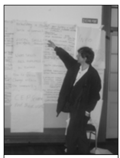
Ideas from the community being recorded and displayed during the Kinsale 2021 event

Students on the Practical Sustainability course at Kinsale FEC have spent the last year looking at what the realities of energy descent could mean for Kinsale, and what could be done about it. They have consulted with many of the leading thinkers in the field, and have researched the issue deeply. In February 2005 they held a one-day event entitled "Kinsale in 2021 - Towards a Prosperous, Sustainable Future Together ". To this event they invited many influential people in Kinsale, and began by showing them the recent awardwinning film 'The End of Suburbia'. The rest of the event was designed as a community think-tank, to enable the community to discuss issues raised by the film and brainstorm ideas about what could be done in the town to address them. The event was a great success, and gave the students many ideas and a feel for the community's hopes and fears. As a follow up to this, a conference is being planned for June 2005, called 'Fuelling the Future - the challenge and opportunity of Peak Oil', which will be addressed by many of the world's experts on the subject and on creative ways of adapting to it. We feel that these, together with this report, constitute very firm first steps towards a more holistic way of approaching Kinsale's future.