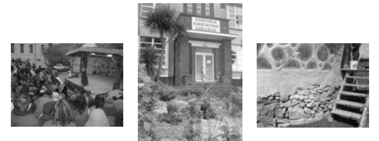
Kinsale 2021 – An Energy Descent Action Plan

The report that you hold in your hand is a very important piece of work. It is the first attempt at setting out how Kinsale, a West Cork town of about 7,000 people, could make the transition from a high energy consumption town to a low energy one. The impending peaking of world oil production will lead to huge changes around the world, and Ireland will not be immune from this.