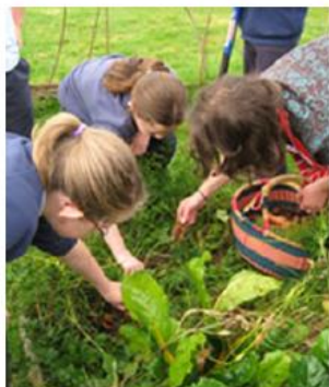
Allotments and Community Supported Agriculture

The "Wild Inspired Education" team of facilitators brings sustainability alive in a fun, practical and creative way in a number of local national schools. They work with an emphasis on student-centered, cross curricular, experiential learning. Their programme includes teaching about food production in gardens that the kids have helped to create.