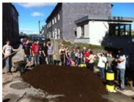
Edible Landscaping and Edible Walk

TTK have worked with Sáile to create a community orchard and garden on their site. Sáile - More than 40 fruit & nut trees have been planted. The Green Team from the community school is pictured here at the site. Fruit & nut tree planting has also taken place in local schools, at the allotment site and in three housing developments. Meitheals are organized to maintain the Orchard.