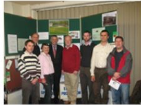
Sustainable Energy Launch of the Anaerobic Digester